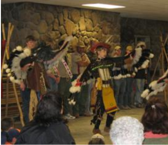
The Kwahadi Dancers Performing the Eagle Dance at the Pow-Wow